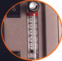
Integral Flow Meter