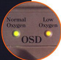
Oxygen Sensing Device